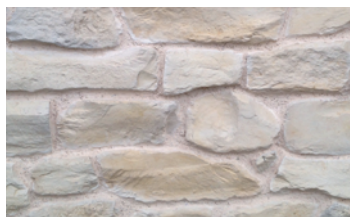
063 Limestone Champagne